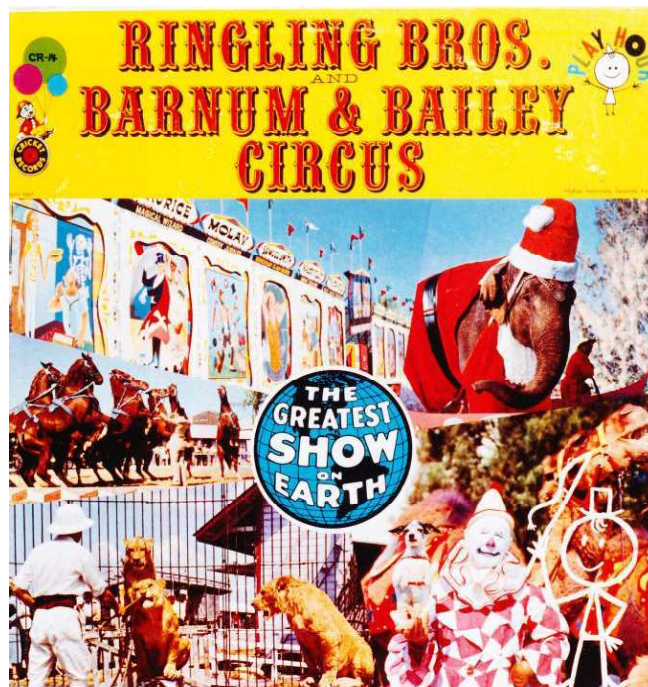
LP Cover - Cricket Records CR-14

(Heard on the annual TV special) Temptation (Brown), drum roll, chord