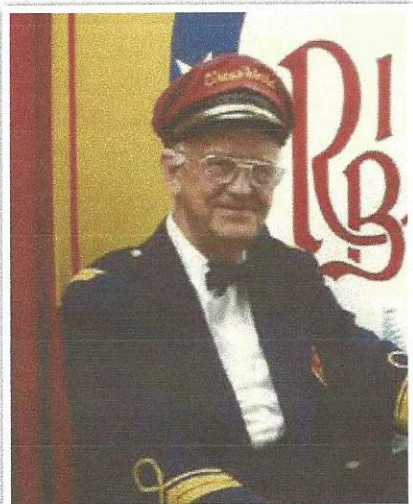
Ringmaster August 1975 at Circus World Museum