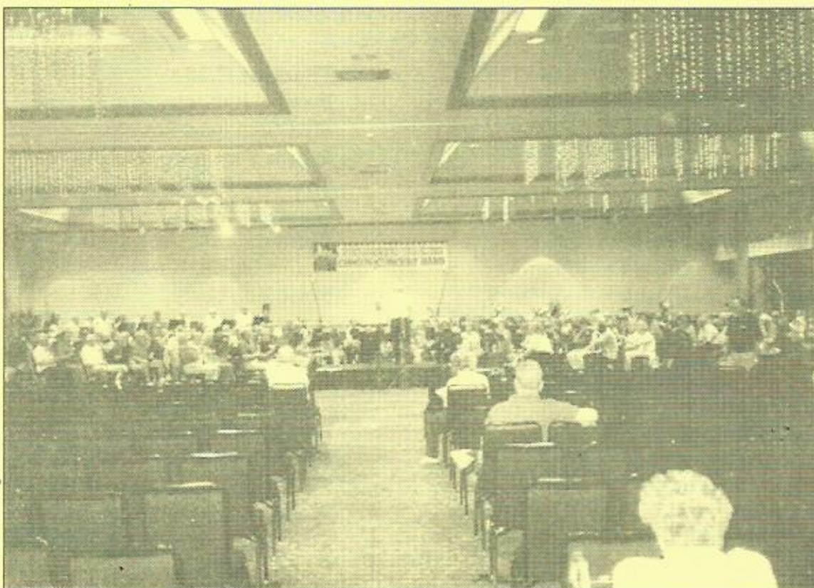
One of the rehearsal/recording sessions -- the 150 member band doesn't even fill a quarter of the room.