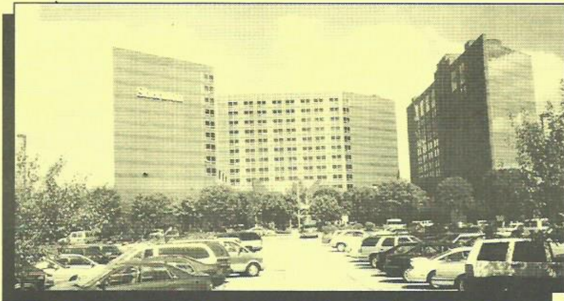
The Sheraton Hotel in Indianapolis--Site of the 2000 Summer Meet

Windjammers Annual 29th Convention January 23 - 28, 2001 Sarasota, Florida