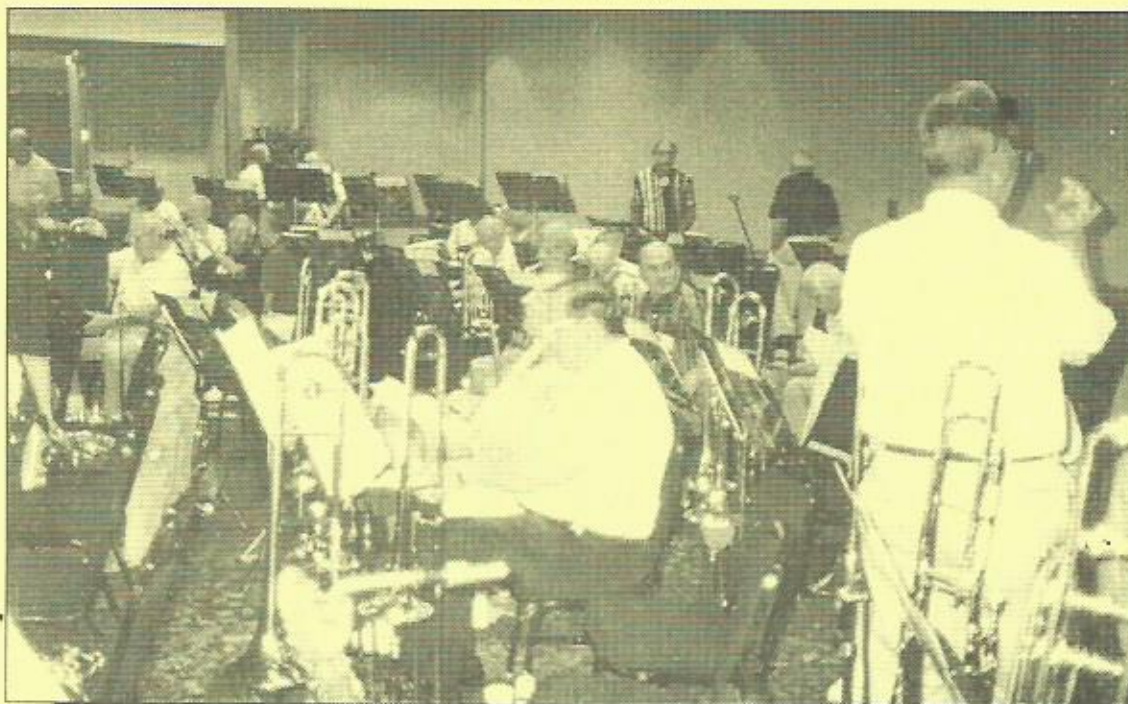
The Eternal Search Through The Folder for Music