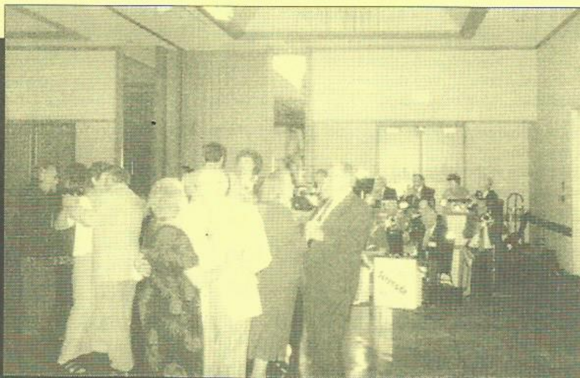
Windjammers Engaged in Terpsichorean Activities following the Banquet