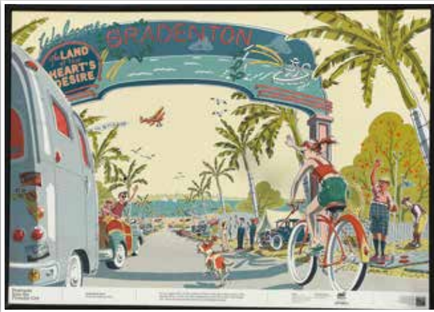
Welcome to Bradenton!