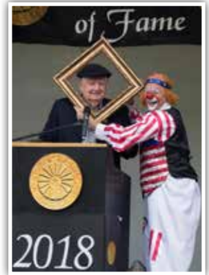
Chucko the Clown