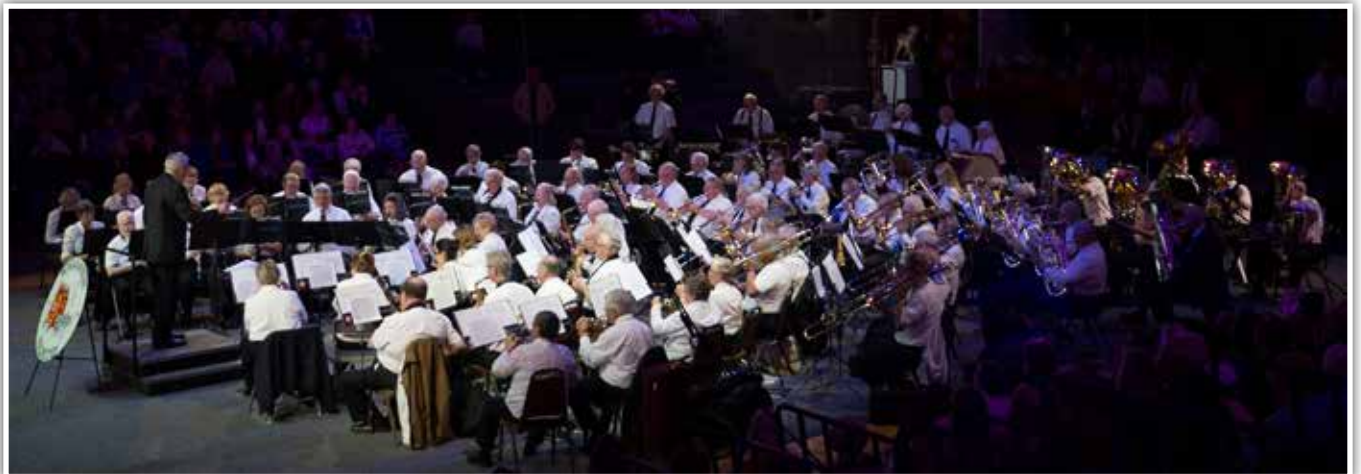
2. Center Ring Concert Band prior to Sailor Circus Academy performance, January 14, 2018.