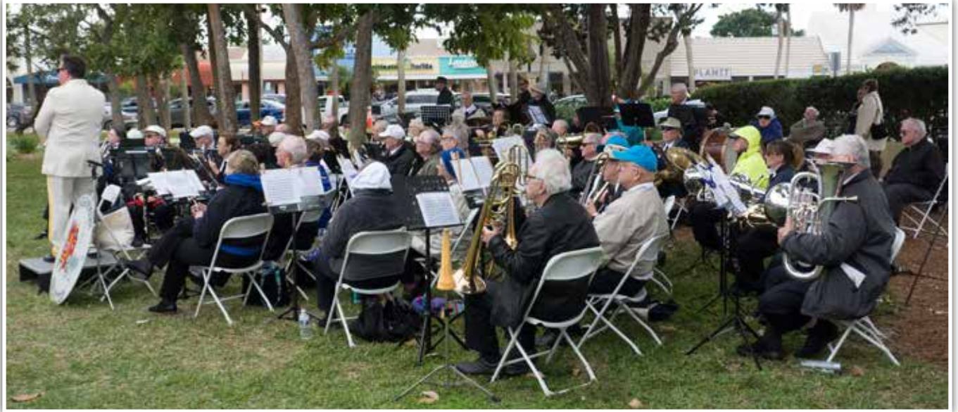
1. Ring of Fame Band at St. Armand's Circle. Cold? Yes, 58 degrees the afternoon of January 13, 2018.