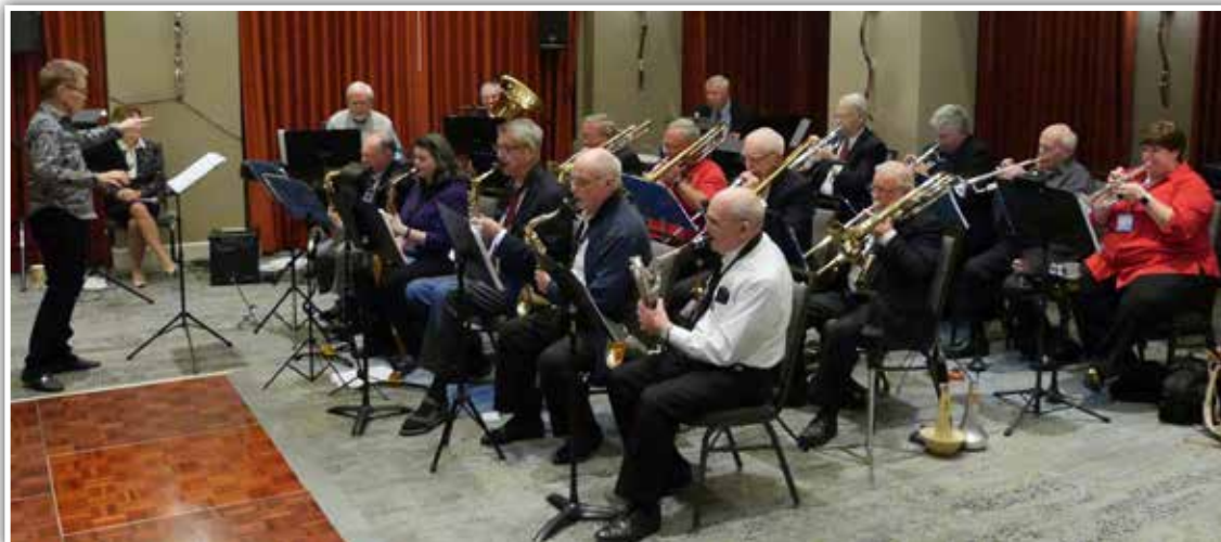
Hal Hazen Memorial Dance Band following the Convention Banquet