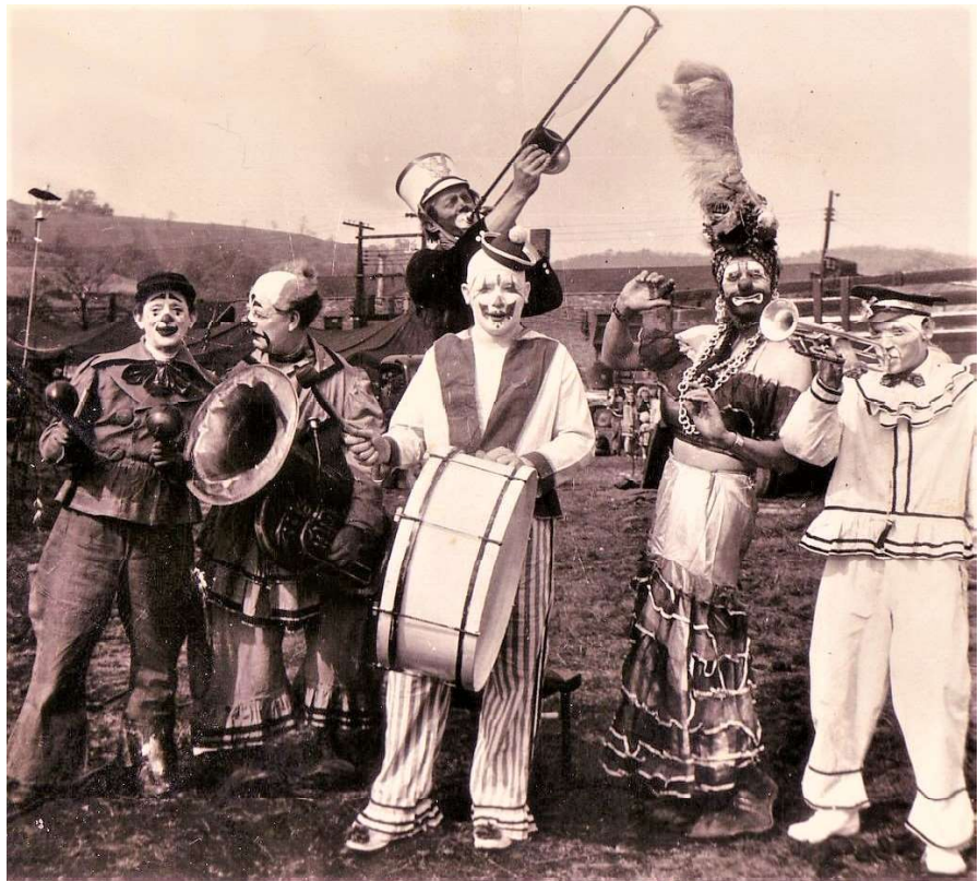
Sparks Circus Clown Band