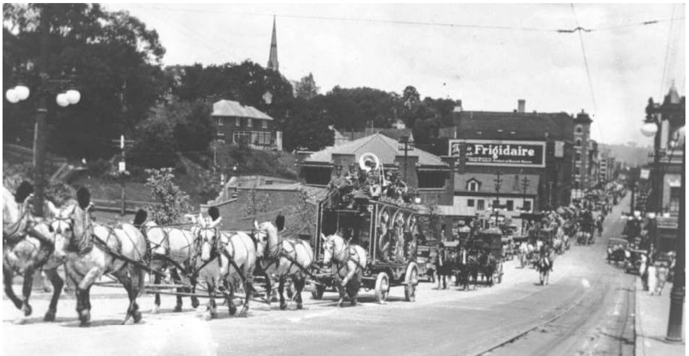
SPARKS BROS. CIRCUS Street Parade with Dolphin Bandwagon in 1927