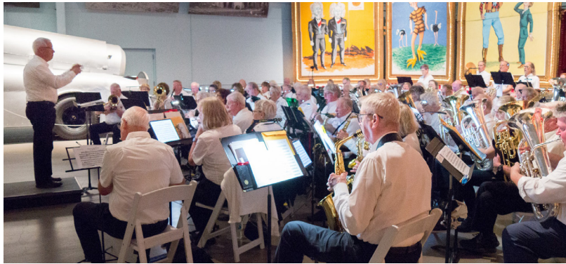
WJU performed a special concert at the John and Mable Ringling Museum during the 2024 Winter Convention in Sarasota/Venice, FL.