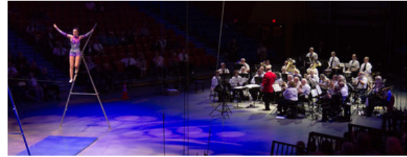
A select band of Windjammers re-create the era of live music each year for the Sailor Circus at the Winter Convention.

It was the toughest possible job for a professional musician. It required constant playing for a show lasting at least two hours with only a 10- or 15-minute break for intermission. There were two shows a day during the week, and three on weekends. You were also required to play in the parade announcing the arrival of the circus, as well as in a center ring concert preceding the actual show. It was high energy music, and you had to play loud enough to be heard throughout the big top. It required leather lungs, iron lips, and highly developed technical skills. Why were circus musicians called “windjammers”? No one knows for sure, but it might have had something to do with the musicians “jamming wind” through their instruments underneath the billowing sail-like canvas of the tent.