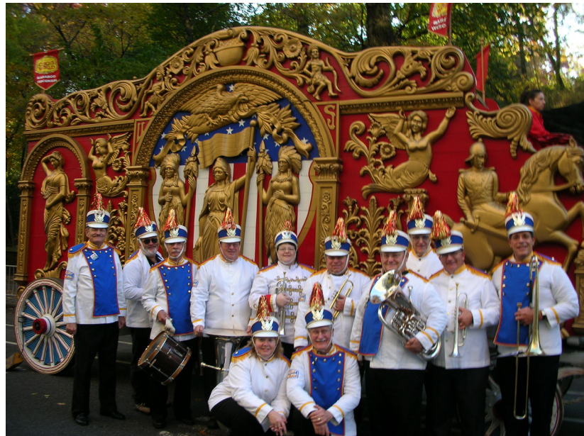
Windjammers with the United States Bandwagon at Macy's Parade, November 2007.

Our organization observed its 50th anniversary in 2021. Since 1973, we have been fulfilling our mission by holding biannual meets (conventions). At each meet, WJU members perform public concerts, play and record 60–70 tunes (some of which haven't been heard in 100 years), and host educational seminars for school music instructors, members and others.